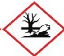
Dangerous for the Environment